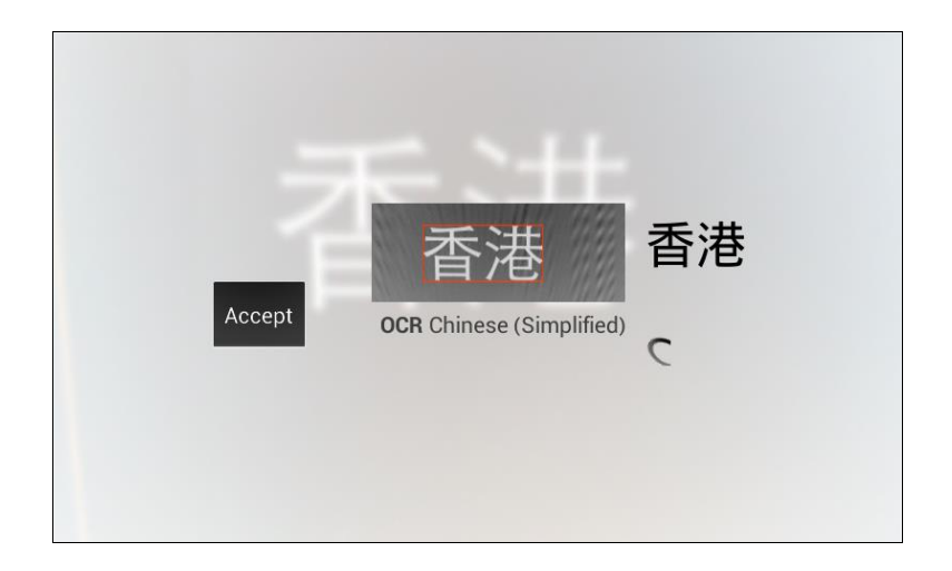
Fig. 1. OCR screenshot

On-line and Off-line Chinese-Portuguese Translation Service for Mobile Applications 605