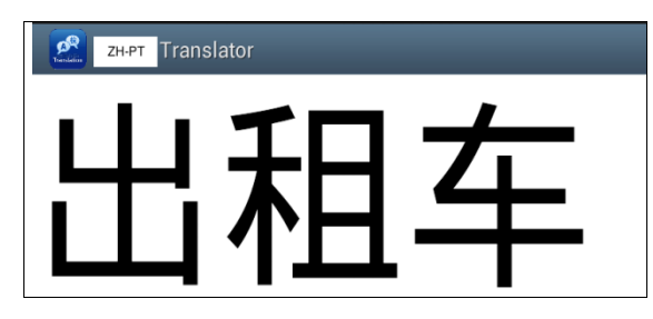
Fig. 3. Full-screen mode

On-line and Off-line Chinese-Portuguese Translation Service for Mobile Applications 607